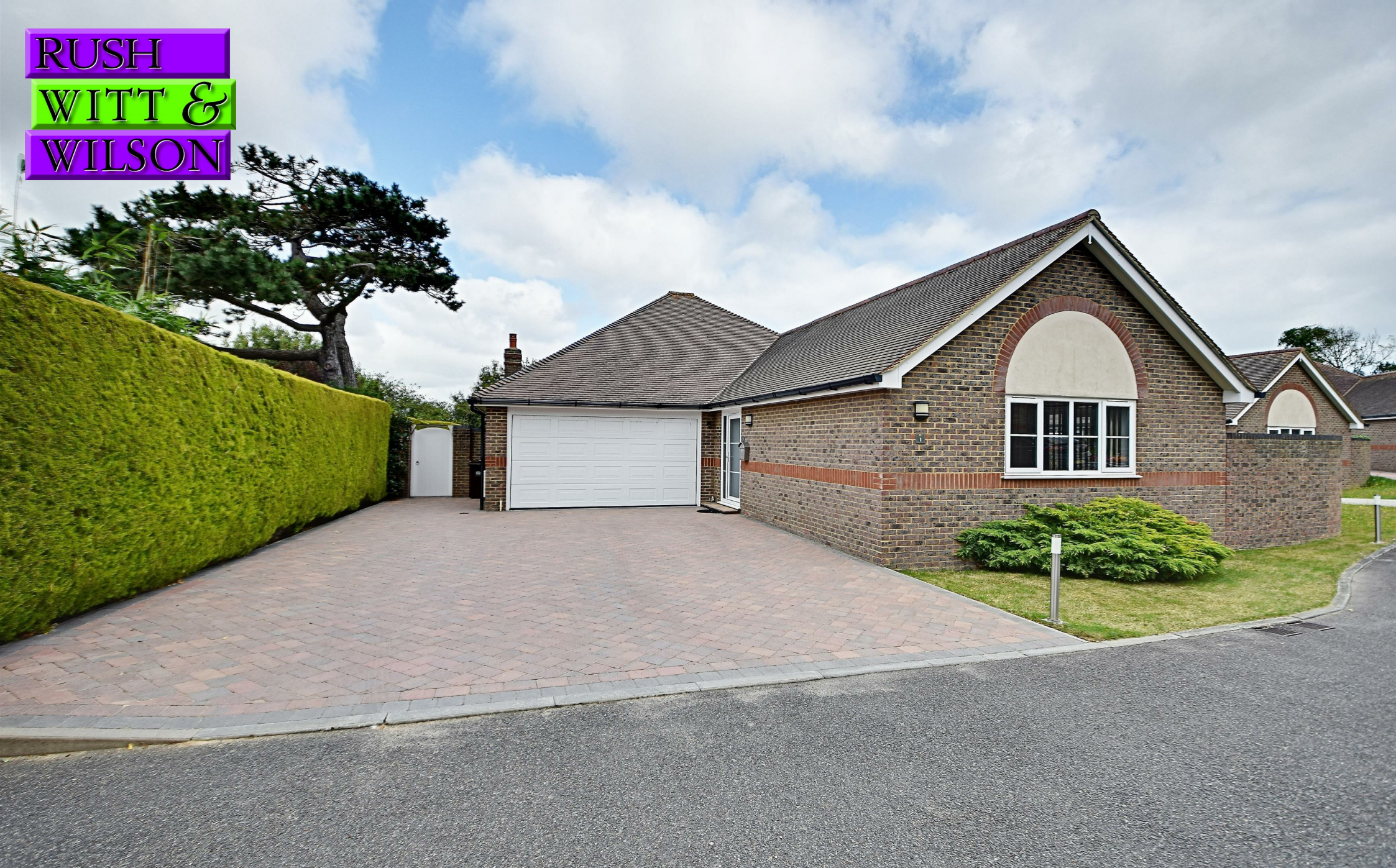
1 Colwall Gardens, Bexhill-On-Sea, East Sussex TN39 3FB £680,000